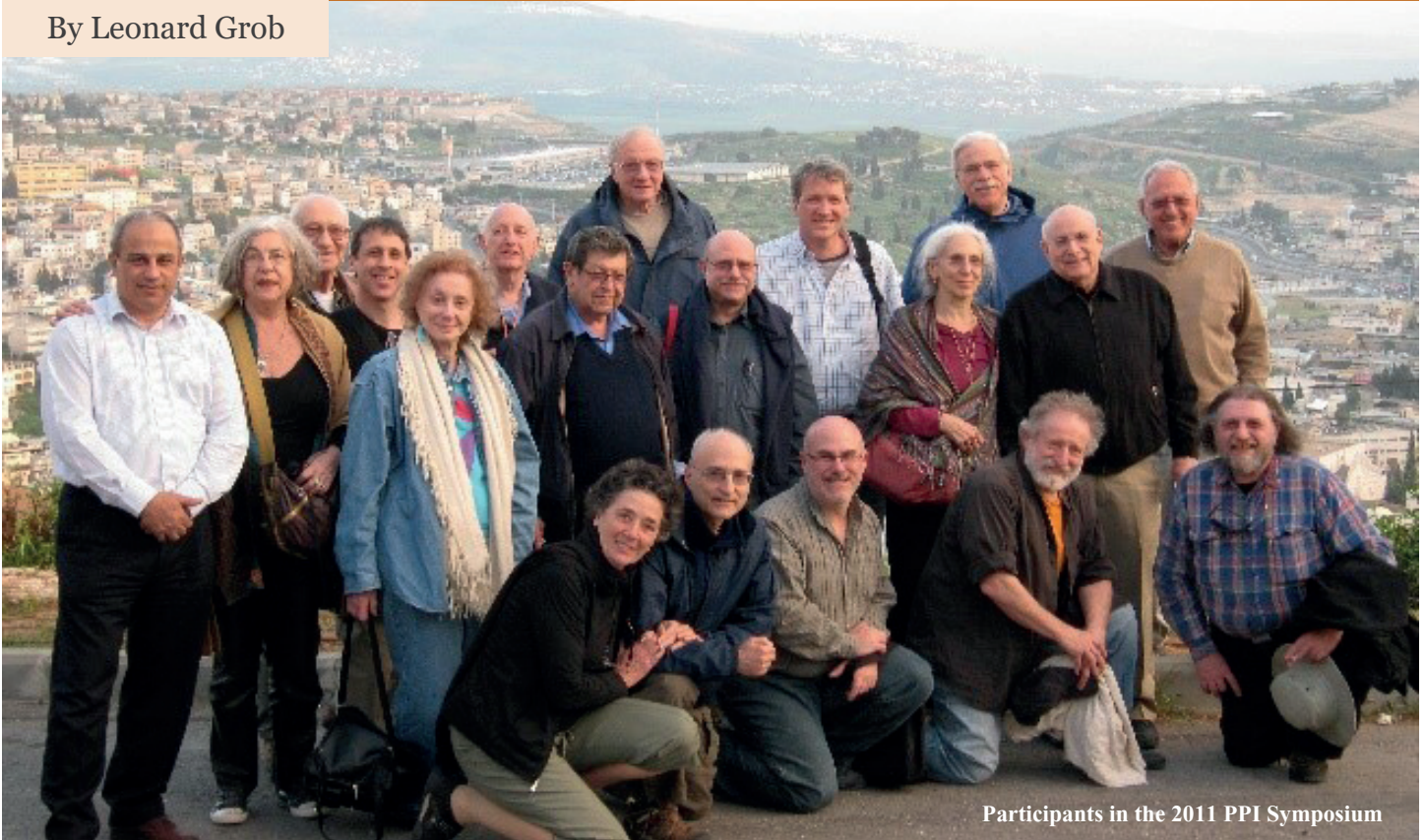
Participants in the 2011 PPI Symposium

In January 2017 I embarked on my ninth consecutive Partners for Progressive Israel Symposium/Study Tour in Israel and Palestine. Over a period of more than two decades, the annual tours have afforded an opportunity for participants to learn, first hand, many of the political, socio-economic, and security concerns of key Israeli and Palestinian leaders and activists. Each Symposium's schedule is jam-packed; we are on the move from early morning to 9 or 10 at night: The intensive nature of each day's programming has allowed me to learn in one week's time what might otherwise call for a visit of much greater duration. And what is learned during a tour speaks to both the intellect and the heart. I have come away from each week's set of experiences with greater compassion for those Israelis and Palestinians--both within and outside of government—who courageously confront seemingly intractable problems on a daily basis. I have come to grasp the tragic paradox that is the existence of conflicting narratives, each of which contains elements that accord with "the truth" as some historians have come to see it. Each tour has reminded me to empathize with the suffering of two peoples in one homeland, while at the same time recalling that Israel, as the stronger party