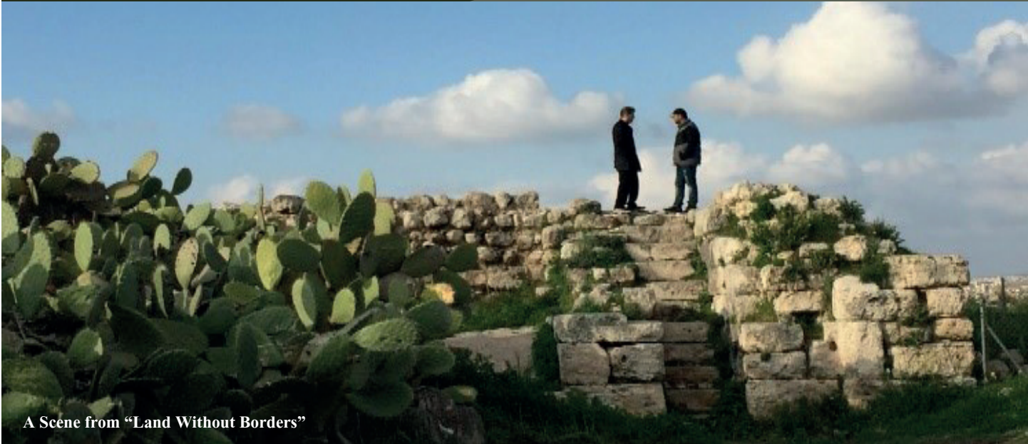
A Scene from “Land Without Borders”

“Land Without Borders” is a sobering film since the future of peace between Israel and Palestinians is a sobering subject. The present situation is untenable, a positive way forward seems impossible. The current status quo is rickety and untenable, though it has lasted for decades. The two state solution increasing seems like a chimera, a beautiful idea that refuses to be captured by reality. And it is failing to even inspire the faithful. The alternatives are either worse—apartheid by another name—or seem even less likely of realization than two separate states. None of the various alternatives for shared Jewish and Palestinian sovereignty seem remotely within the realm of political possibility. Increasingly, when thinking of the Israeli and Palestinian morass, I am reminded of the famous remark by Sherlock Holmes: “Once you have eliminated the impossible, whatever remains, no matter how improbable, must be the truth.” But even the celebrated Mr. Holmes would have problems solving a case when all the solutions seem impossible. And yet the situation is far too dire to lapse into inaction or cynical despair. This is the state of affairs that Nir Baram explores in his film “Land Without Borders.”